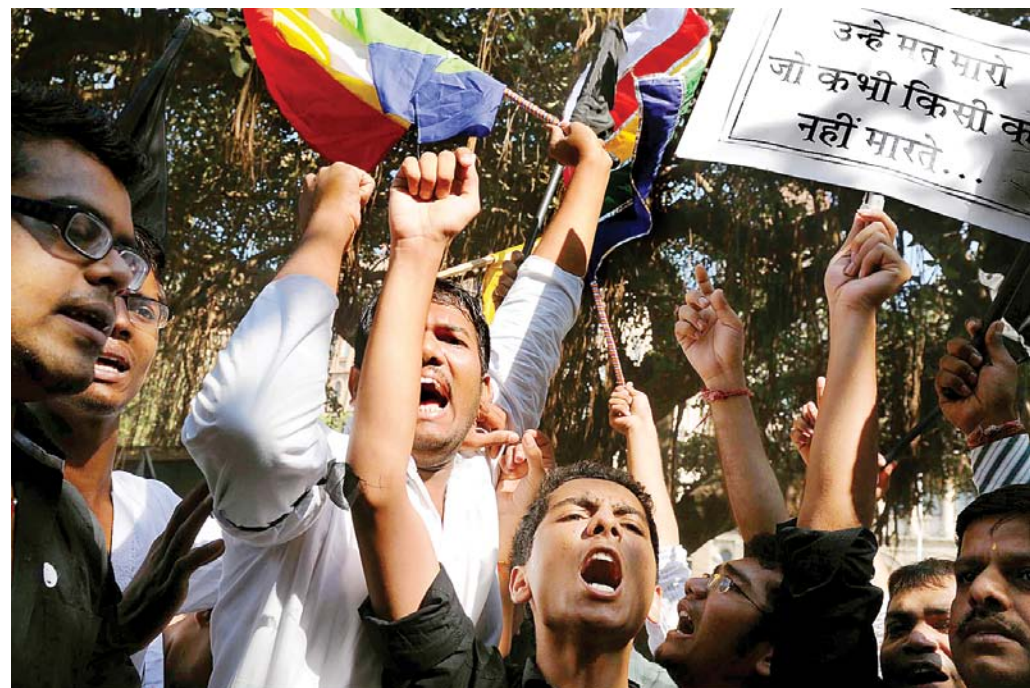
Jains protest in a rally near Azad Maidan demanding protection for members of their community