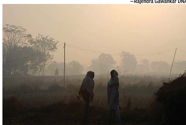
Temperature dipped to 12 degrees Celsius near Ambernath

Unlike Sunday which saw both the maximum and minimum temperatures fall by an average of 3 degrees, on Monday, the fall was less uniform and diverse. And the sharpest fall below normal - 11.3 degrees Celsius at Santa Cruz - was also lesser than that recorded on Sunday.